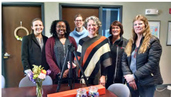
Rinderknecht Associates surprise the staff at Kids First with a check and easels from the Kids First wish list!