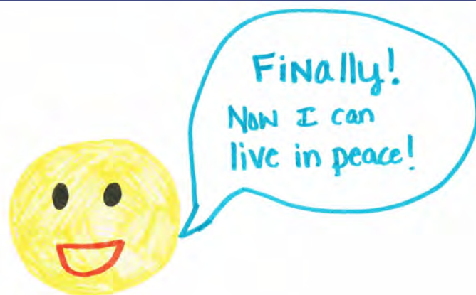
Drawing by girl, age 11

"You are kind. You help me with my problems." - Girl, 10