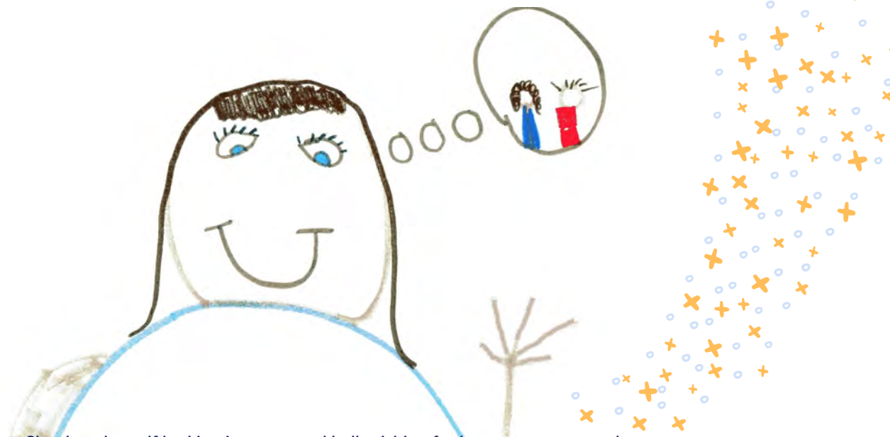
Drawing by girl, age 8. She drew herself looking into a crystal ball, wishing for her parents to get along.