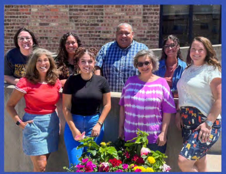
Turning tug-of-war tensions into teamwork. Kids First's peace facilitators help students find common ground—pulling kids together, not apart.